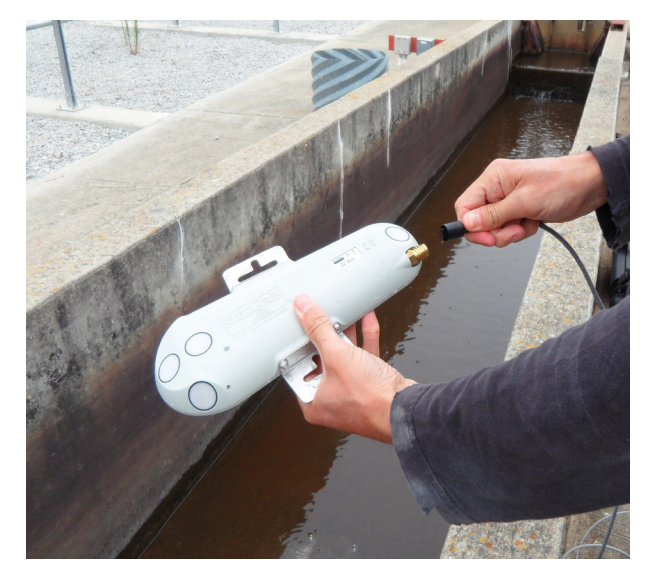
The SonTek-IQ is a multi-beam acoustic flow meter with five 3.0 MHz transducers. Redundant water level data are recorded from the vertical beam and pressure sensor. Data download and communication are available via RS232, Modbus or SDI-12. Flow rates and total water volumes are computed internally based upon a user supplied survey of the channel shape and instrument location.

SonTek Product Manager Mike Cook and HydroScientific West representative Diego Davis prepare a SonTek-IQ installation site in one of the SSJID laterals. User friendly mounting brackets allow them to install the SonTek-IQ by simply inserting two bolts 12.7 cm (5 in) apart along the center line of the channel. The orientation of the slots on the mounting plate to allows users to orient the instrument in the direction of flow. Ultra-low power consumption allows for smaller solar panels and batteries – making monitoring less conspicuous.