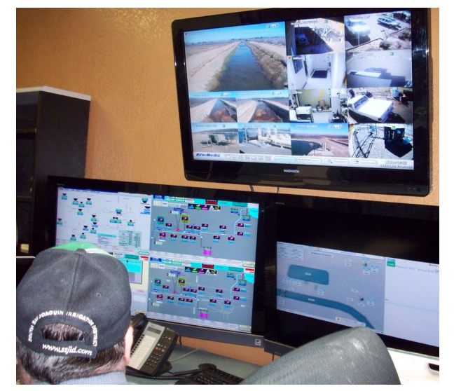
BEHIND THE SCENES. A view of the South San Joaquin Irrigation District's modern canal control center, where turnout management is an impressive 21st century science.

Greater efficiency in the irrigation system has far-reaching benefits, Shields adds. "First and foremost, it's to meet years when we have drought," he notes. "But we also expect to have more surpluses more often. When we have surplus, we can try to export water for other farm uses."