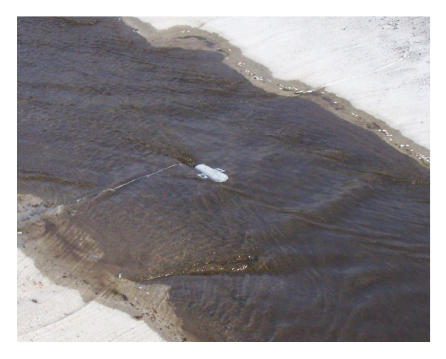
The SonTek-IQ can accurately measure flow in as little as 3 inches of water is extremely valuable to SSJID when measuring smaller canals or drains.